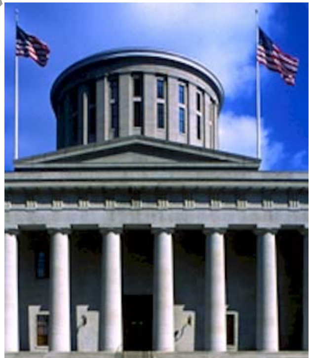
The Ohio Statehouse Restoration Project